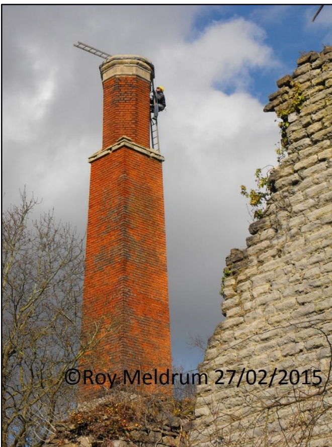
Repair work underway, Brandy Bottom Colliery