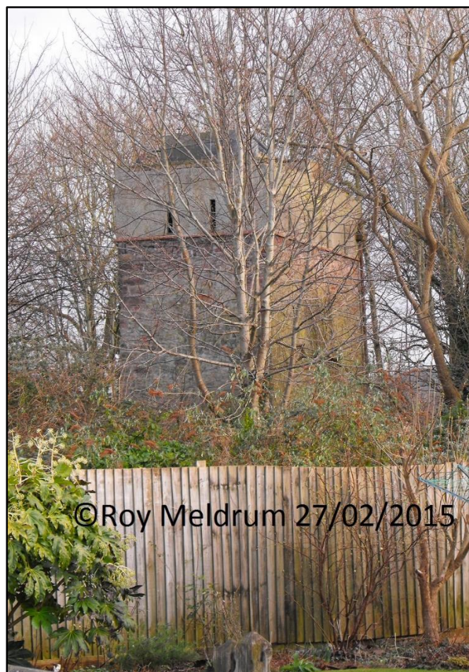
Remains of Middle Engine Pit, Nailsea

Middle Engine Pit, also known as Elms Colliery, is reported to be the most complete example of an early 19 th century colliery remains in England. The site, which has been owned by North Somerset Council since 1996, has suffered from neglect and vandalism, with the condition of the three surviving buildings in danger of collapse. English Heritage are working with the Council to draw up plans improve the condition of the site, with the possibility of it becoming a valuable community asset. The site is currently on English Heritage's 'At Risk' Register.