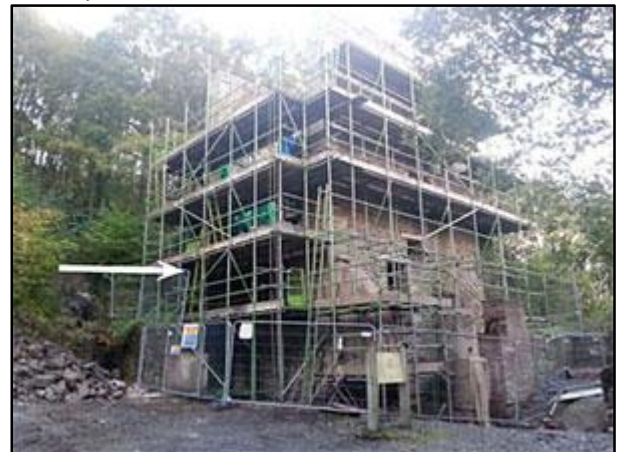
Above: Lords Hill beam pumping engine house as it appeared at the end of October 2014.

Walls have been repaired in the winding engine and boiler house area. The major work appears to be on the pumping engine house. The bob wall has been taken down as far as the lintel over the doorway above the condenser/air pump cistern (see the white arrow in the picture).