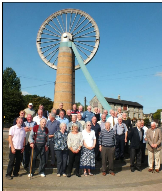
Miners Reunion at Radstock Museum.