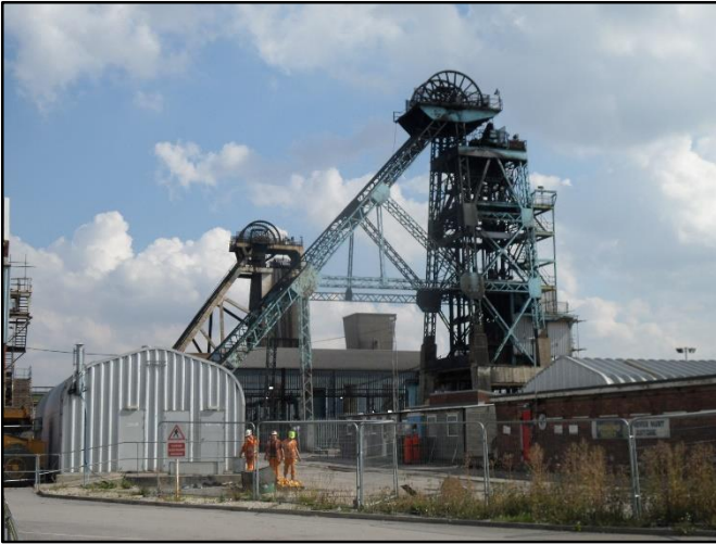
Hatfield Main No1 & No2 headstocks

As reported in the last NAMHO Newsletter a campaign is underway to save the headstocks at recently closed Hatfield Main Colliery. The Hatfield Main Community Heritage Association (HMCHA) were aiming to save the No1 headstock as a memorial to the devastated Doncaster Area Coalfield and a fitting National monument to the Coal Mining Industry.