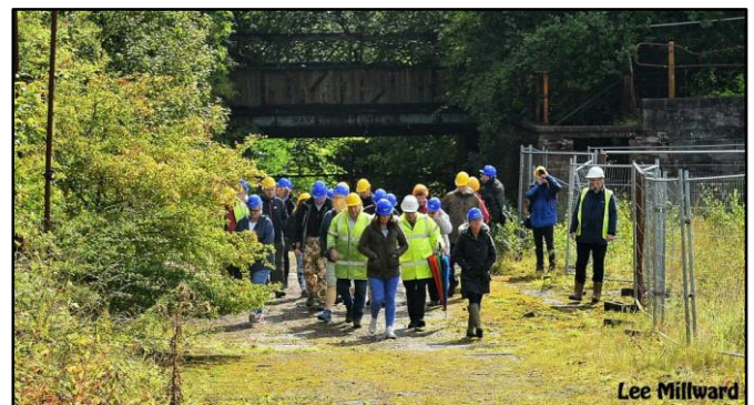
Chatterley Whitfield HOD Tour.

This year was a challenge as the City Council had been a great help in previous years by organising advertising and the pre-booking arrangements. However this year due to financial cut backs and staff being made redundant they could not help. So the 'Friends', made a decision to organise the event itself, which this year consisted of 10 tours, catering for 250 people during the day.