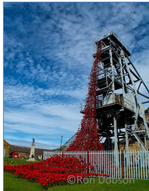
Woodhorn Colliery No1 headstocks

http://www.bbc.co.uk/news/uk-england-tyne-34688086